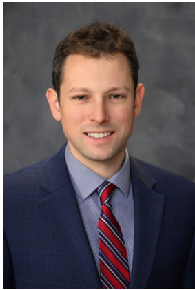
Mayor Reuben D. Holober District 3